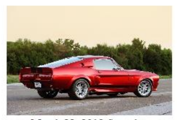
March 23, 2019 Saturday At Mingus Union High School